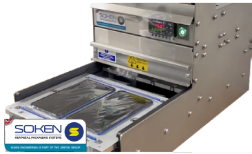
Soken HS34ACF SEMI-AUTOMATIC BOARD SEALER

High pressure and temperature film lid seal system