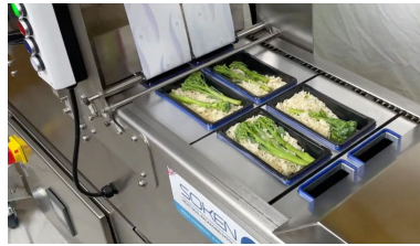
Soken HS55 LINEAR AUTOMATIC FILM AND CARD SEALER

Can produce up to 2,800 sealed packs per hour