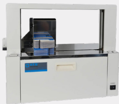
MS 420 TABLE-TOP PAPER BANDING Tamper evident banding, ideal for multipacks