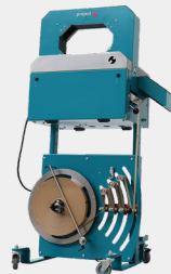
Proband V2000 INNOVATIVE PAPER BANDING Ecological banding with