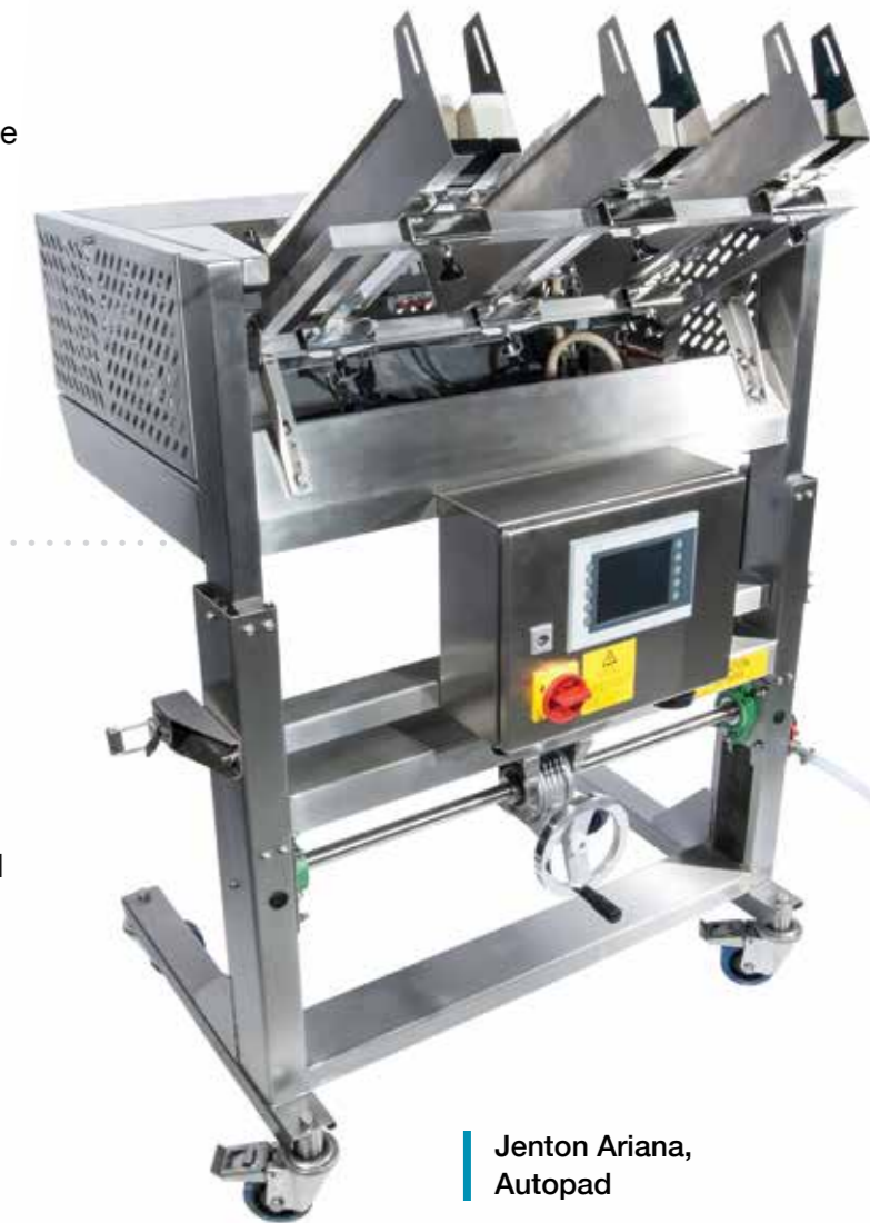
Jenton Ariana, Autopad

Interchangeable pad cassettes make this ideal for multi product lines