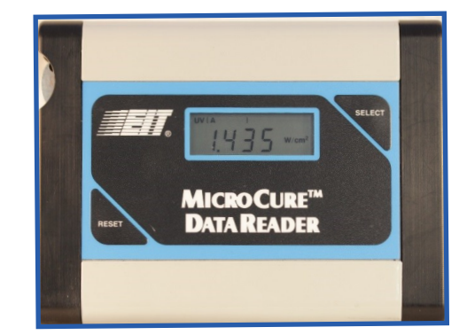
Actual size: 1.3" x 0.95" x 0.25"