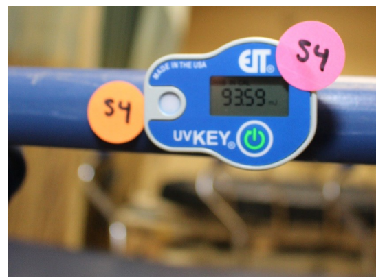
The EIT 2.0 UVKey can be used to easily confirm the numerical dose value of UVC in an operating room (left) and in high touch patient areas such as a bed rail (above)